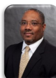
Travis Tate Criticality, Shielding, and Risk Assessment