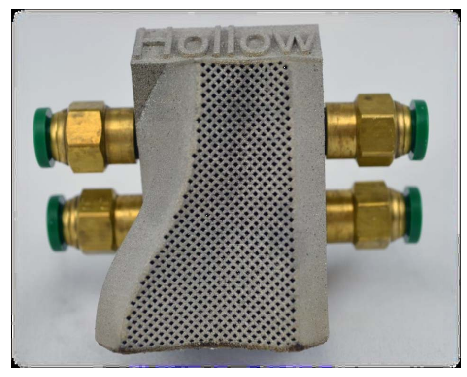
Fig. 4. Redesigned electrode fin.

Initial testing revealed a polishing gradient related to the distance of the electrolyte flow. The polished surface was smoothest near the part edge where the electrolyte first contacted the part. It grew rougher as the distance increased from the leading edge. The gradient effect was exaggerated by the length and multi-contoured shape of the target turbine blade surface and could result in part failure. To combat this, the polishing electrode was perforated on the multi-contoured polishing surface and embedded with internal flow passages. This allowed the electrolyte to be passed through the electrode and deposited more uniformly across the target part surface.