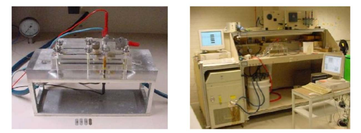
Fig 1. Flow Channel Cell (FCC) and related equipment.

Prior to machining, the surface roughness of the Arcam Electron Beam Melting Inconel 718 test samples was out of range for the measuring equipment. To investigate the dissolution behavior under conditions used in electrochemical machining tests were performed using a flow channel cell (FCC, Fig.1), in which the conditions of interest can be measured and varied. In this research the influences of pulse waveform, electrolyte temperature and electrolyte type were investigated. Following machining, roughness was measurable, thus demonstrating the effectiveness of the machining technique. The surface roughness Ra after ECM decreases with increasing supplied charge; the lowest surface roughness was measured on the coupons which were exposed to a charge of 250C (Fig. 2). ECM noted a gradient in surface finish that depended upon the electrolyte flow direction, which prompted a question as to whether the part orientation during the additive build phase was important to the post machining process. A gradient in surface finish dependent upon the distance of electrolyte flow with respect to the target surface edge revealed the need for more uniform flow.