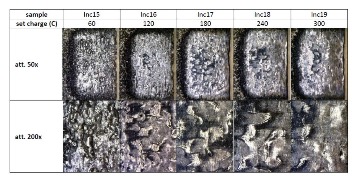
Fig. 2. Surface appearance of electron beam melted Inc718 after ECM treatment with different supplied charges.