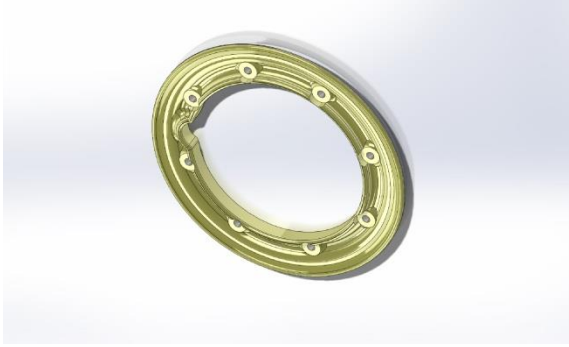
Figure 2: Wheel cover