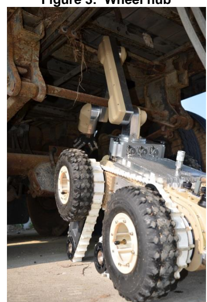
Figure 5: Maneuvering in confined spaces