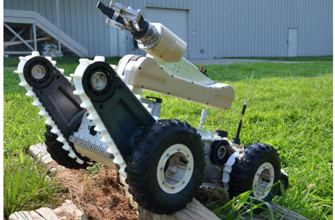
Figure 4: Printed wheels moving over obstacles