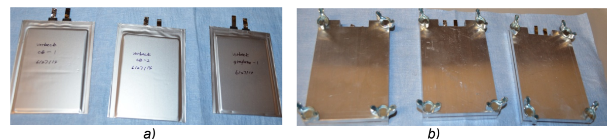
Figure 1. NMC/CB and NMC/graphene pouch cells a) individual pouch cell and b) test units

Cathode materials were also assembled into pouch cells for testing (Figure 1). Because of the limited amount of cathode material which was able to be effectively cast with the slot die coater, only a single pouch cell was successfully constructed with NMC/graphene. The pouch cells with carbon black and graphene were characterized for their rate performance. The cells were charged at C/5 to 4.2 V followed by constant voltage charging at 4.2 V until I \le C/20 and then discharged at various C-rates. For comparison, the discharge capacity was normalized to their theoretical capacities. Figure 2 shows rate performance results. The two NMC/CB cells showed excellent rate performance and were almost identical to ORNL baseline cells. The NMC/CB cells were also very consistent showing good reproducibility in electrode coating and cell assembly. The one NMC/graphene cell demonstrated higher capacity retention than the NMC/CB cells up to C/2, but suffered dramatic drop in capacity at high rates. This is not in agreement with the coin cell results. All three pouch cells showed comparable capacity when cycled at 1C/-2C at the end of rate test to that when cycled at 0.2C/-2C during the rate test.