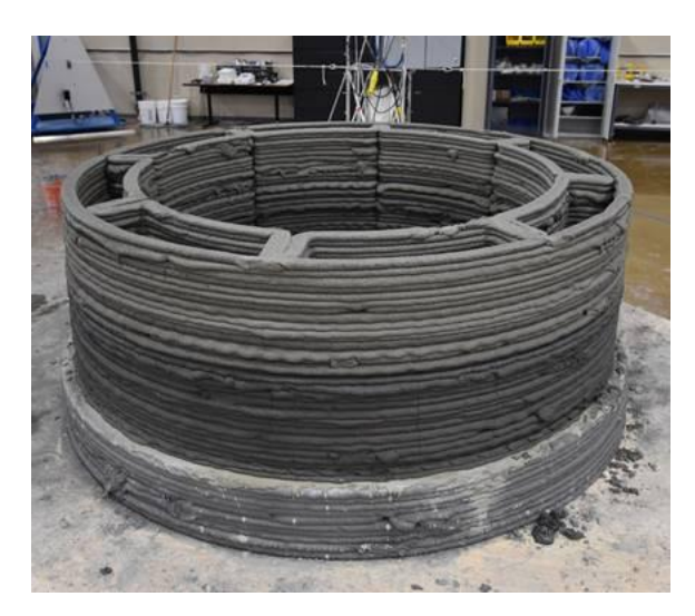
Figure 3. Test article with geometry similar to wind turbine pedestal

The test article printed is the largest concrete structure printed to-date on the SkyBAAM system. The structure consists of a two-bead base that was filled with solid concrete to provide a stable foundation capable of supporting the weight of the printed structure. Then, the remaining structure was printed on top of the base, also with two beads: One outer bead and one inner bead that created the geometry shown in Figure 3. The part was printed at a speed of 1 in/s with a bead geometry of 2 x 1.5 in. The final part was 4 ft tall with a diameter of 8ft 6in. The weight of the final part was approximately 7,000 lbs.