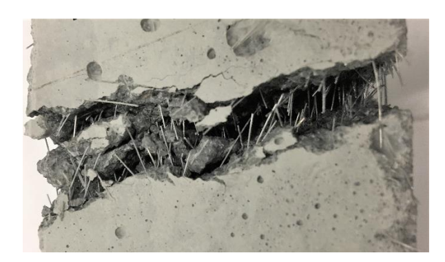
Figure 1. Concrete with fiber reinforcement, tested for strength

After GE provided the material specifications, ORNL began to identify and evaluate cement-based materials that would be suitable for 3D printing. ORNL concrete researchers explored many mixes and performed slump tests on various specimens to determine the best mixture for this application. Research included adding a variety of materials to the concrete mixture, such as Poraver recycled glass aggregate and metal reinforcement fibers, as seen in Figure 1.