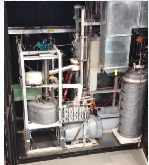
Overview image of LSTL

ORNL is managed by UT-Battelle for the US Department of Energy