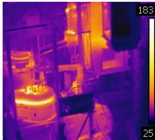
Thermal image of LSTL during operation