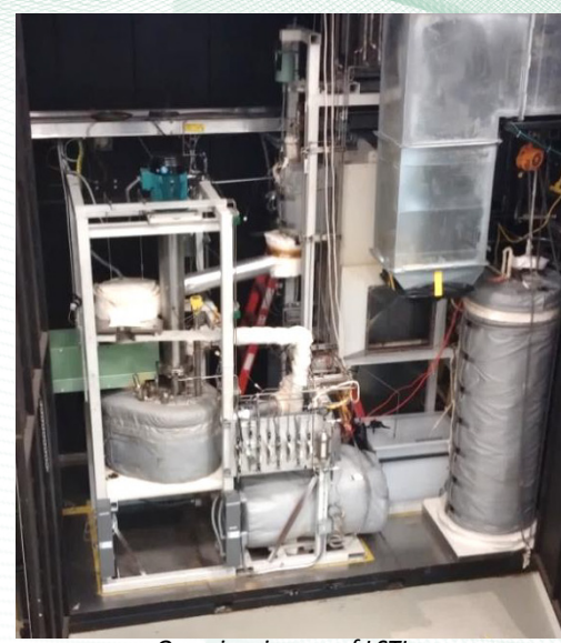
Overview image of LSTL