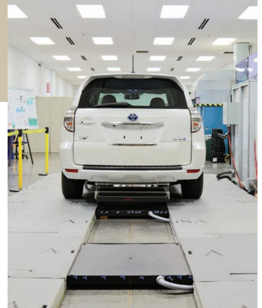
ORNL's 20-kilowatt wireless charging system features 90 percent efficiency.