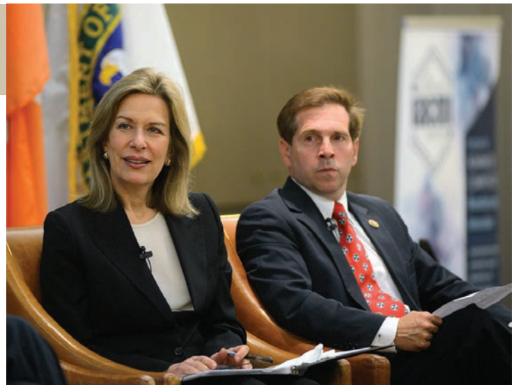
Deputy Secretary of Energy Elizabeth Sherwood-Randall and Rep. Chuck Fleischmann during the May 23rd ORNL Chattanooga announcement.